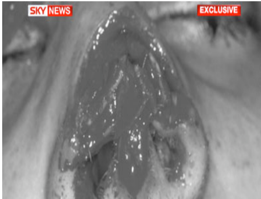
Nose bitten off during binge drinking.

1 of every 4 students: 25.2% of 12 th grade students reported drinking 5 or more drinks in a row (binge drinking) during the previous 2 weeks.*